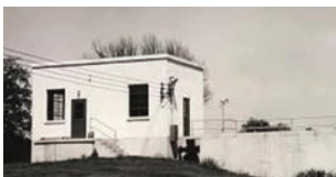
Original Water Treatment Plant

In April of 2023 Hendersonville Utility District celebrated 75 years of dedicated service to the Hendersonville community by hosting a customer appreciation day at their administration building.